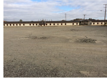
Commissary Site APN 157-970-03

PROJECT: Hamilton Field—Federal Lands to Parks Exchange