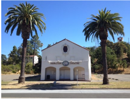
Hamilton Theater Town Center Site APN 157-690-47