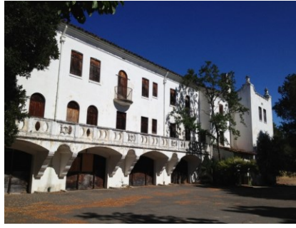
Bachelor Officer's Quarters "BOQ" Site APN 157-690-53