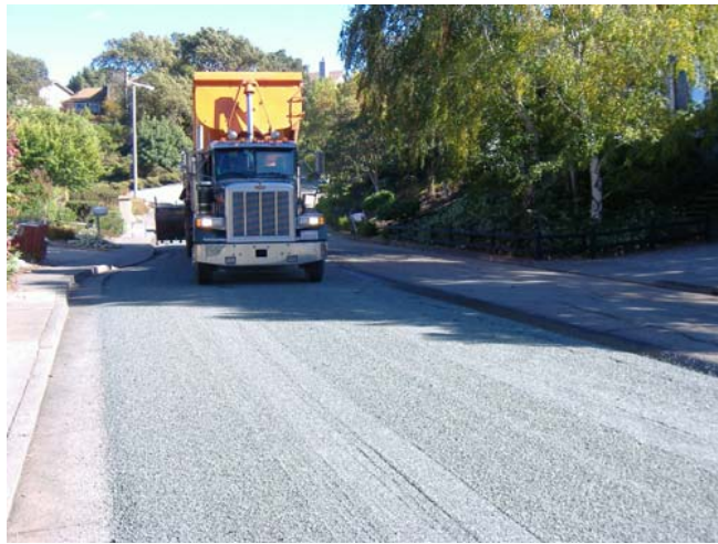
Application of Rejuvenating Scrub Seal utilizing polymer modified asphalt oil and rock chips.

The passages of the City's Measure B and County's Measure A, indicated that Novato and Marin residents have a strong desire to upgrade and maintain community streets. Using the rejuvenating scrub seal and micro-surfacing / slurry seal pavement rehabilitation method, the City has found an environmentally superior, cost effective method which will allow the City to fully realize the goals of these programs, resulting in far less disruption to neighborhoods and the environment, while providing the street with a longer useful life.